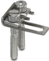
Switching jumper, pitch: 8.2 mm, number of positions: 2, color: silver

Please be informed that the data shown in this PDF Document is generated from our Online Catalog. Please find the complete data in the user's documentation. Our General Terms of Use for Downloads are valid ( http://phoenixcontact.com/download )